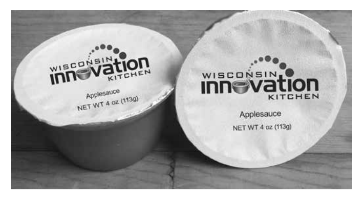
Wisconsin-sourced apples, Mineral Point, WI